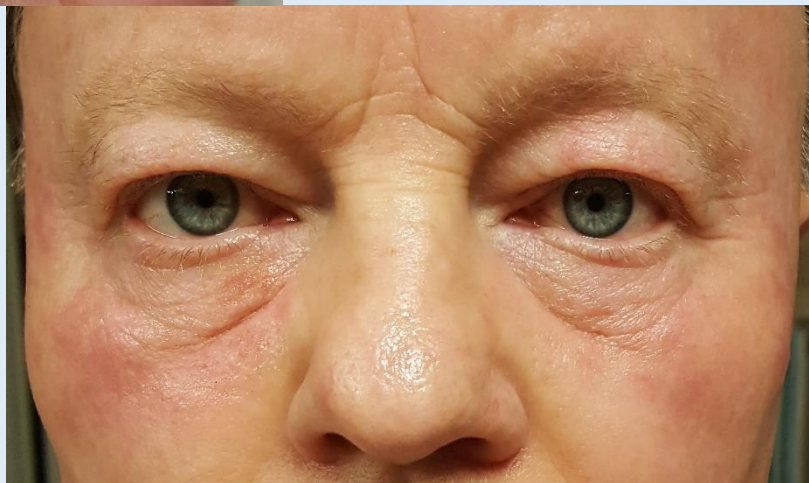
2 nd treatment was periocular only.